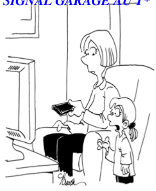
"Mom, what comes first for celebrities? Botox or detox?"